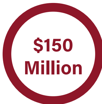
Refunded to Members since 2017