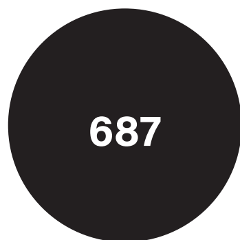
Incorporated co-operatives and credit unions