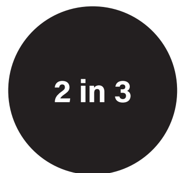
Albertans are a member of a co-operative or credit union